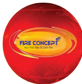
ROUND SHAPED FIRE BALLS