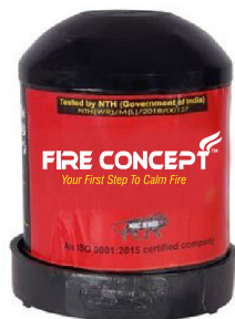
DRUM SHAPED FIRE BALLS

Automatic Fire Ball is a new revolutionary product which extinguishes fires, when in direct contact with flames. Install near fire-prone areas or throw it into a live fire and it will act automatically burst within 10 - 15 seconds. It consists of two categories -